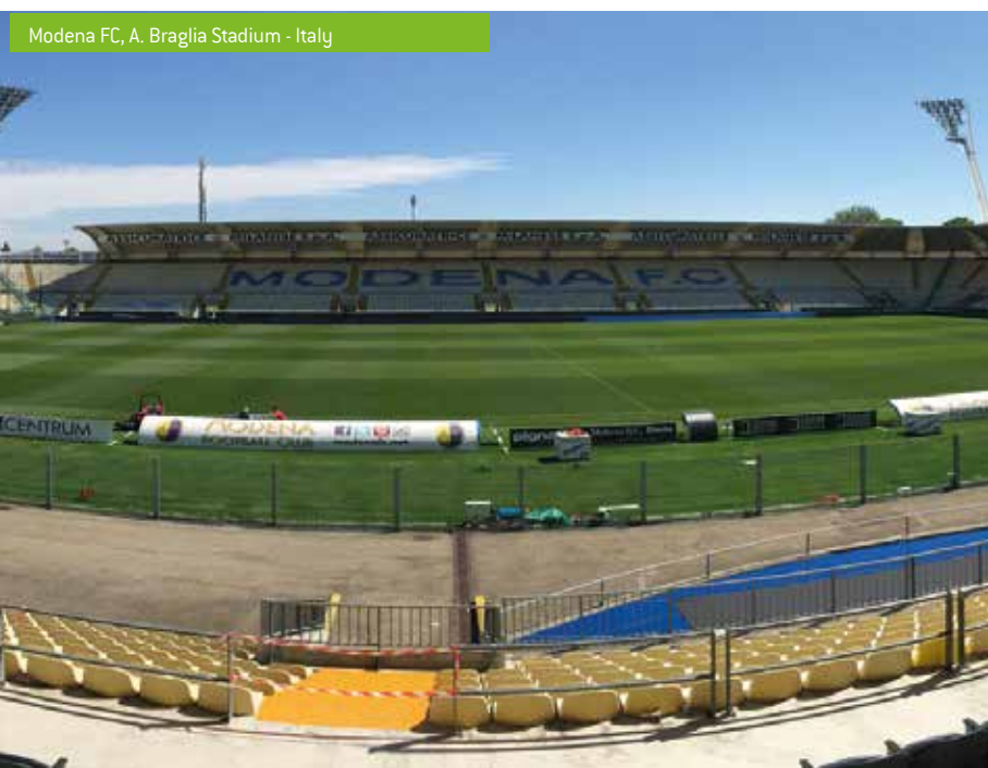
Modena FC, A. Braglia Stadium - Italy