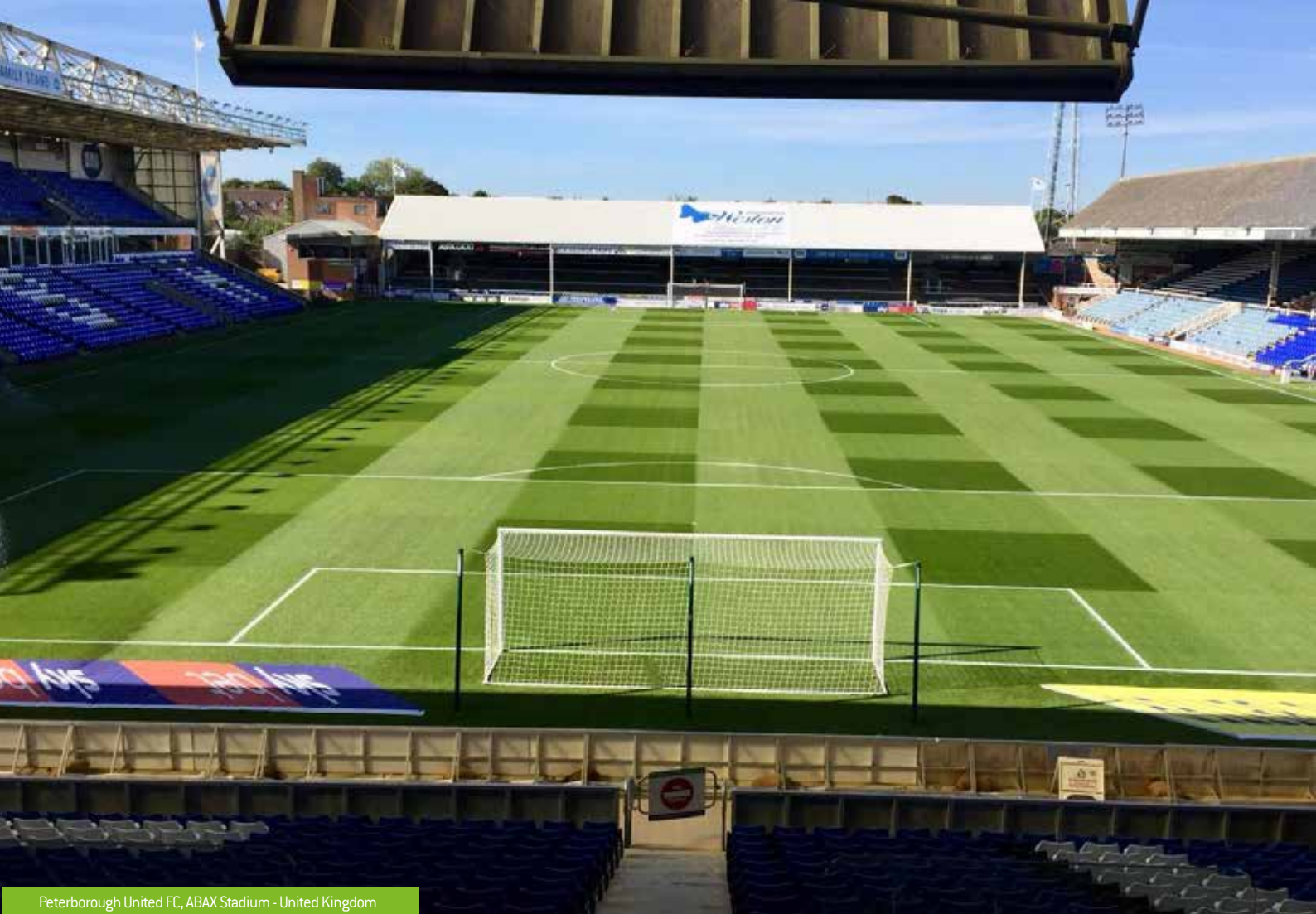
Peterborough United FC, ABAX Stadium - United Kingdom